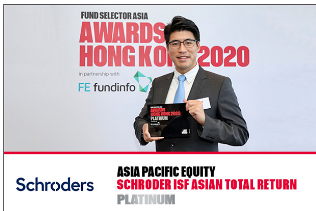
Example - Fund Awards tailored photo

Alternatively trophy plaque(s) can be delivered by courier.